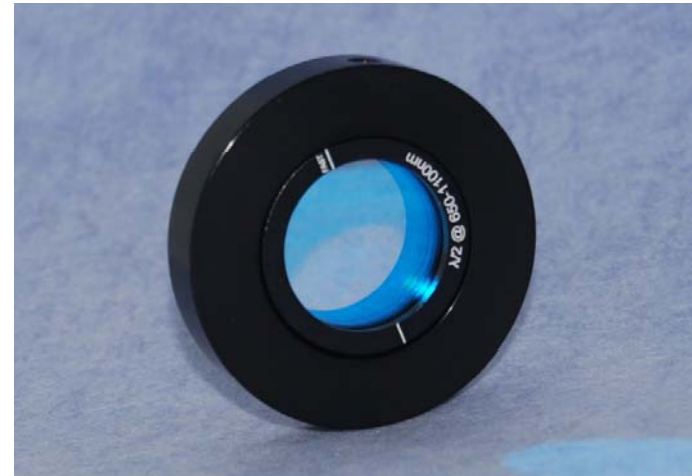
Adaptor ADA-302 with an OD 30.0mm waveplate mounted

for rotation of the principal axis of the waveplate.